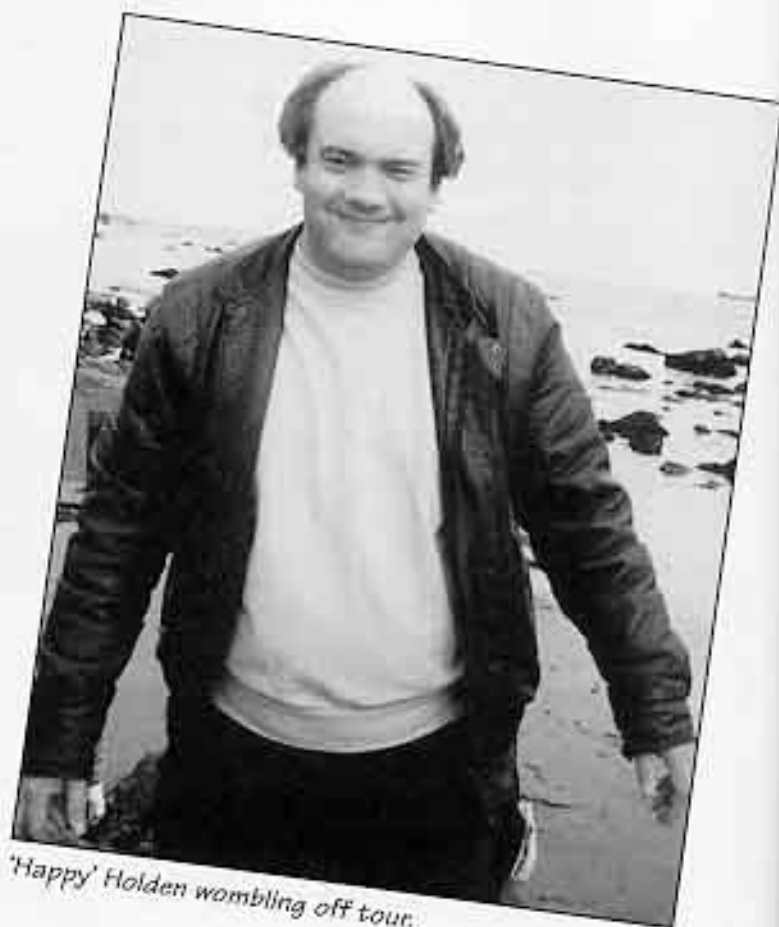
'Happy' Holden wombling off tour.

• Photos of Nina and Candy not available for press. They refused to unlock the door.