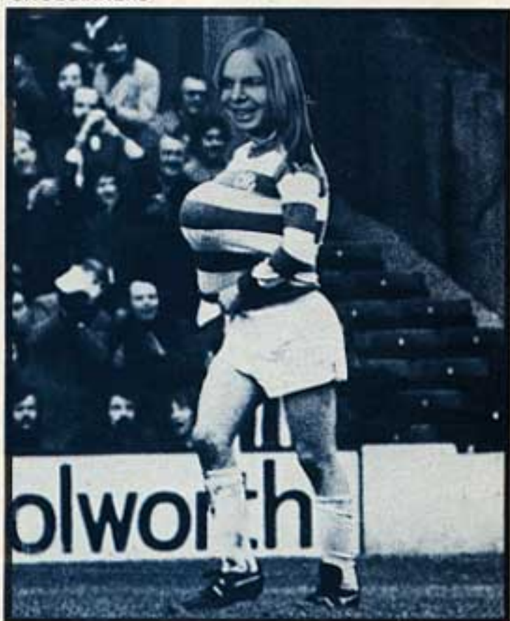
THOSE LACKING IN IMAGINATION CONTACT IRIS TITWOBLER