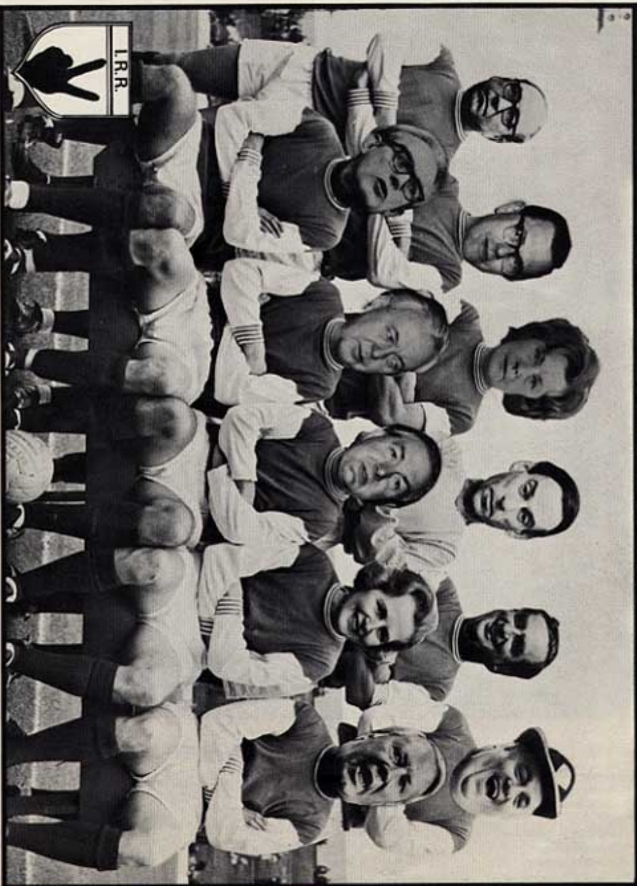
Back Row (Left to Right) ROY JENKINS REG MAUDLING BARBARA CASTLE JEREMY THORPE DENIS HEALEY CYRIL SMITH Front Row (Left to Right) MICHAEL FOOT HAROLD WILSON JIM CALLAGHAN (Captain) MAGGIE THATCHER TED HEATH