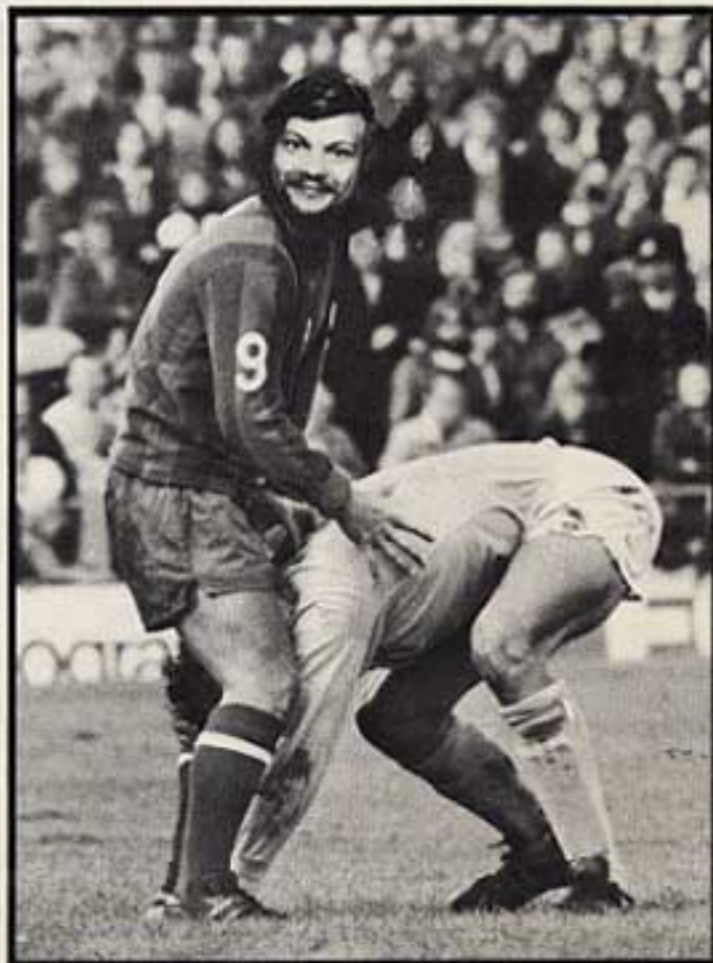
MARTIN'S VERSION OF THE KISS OF LIFE