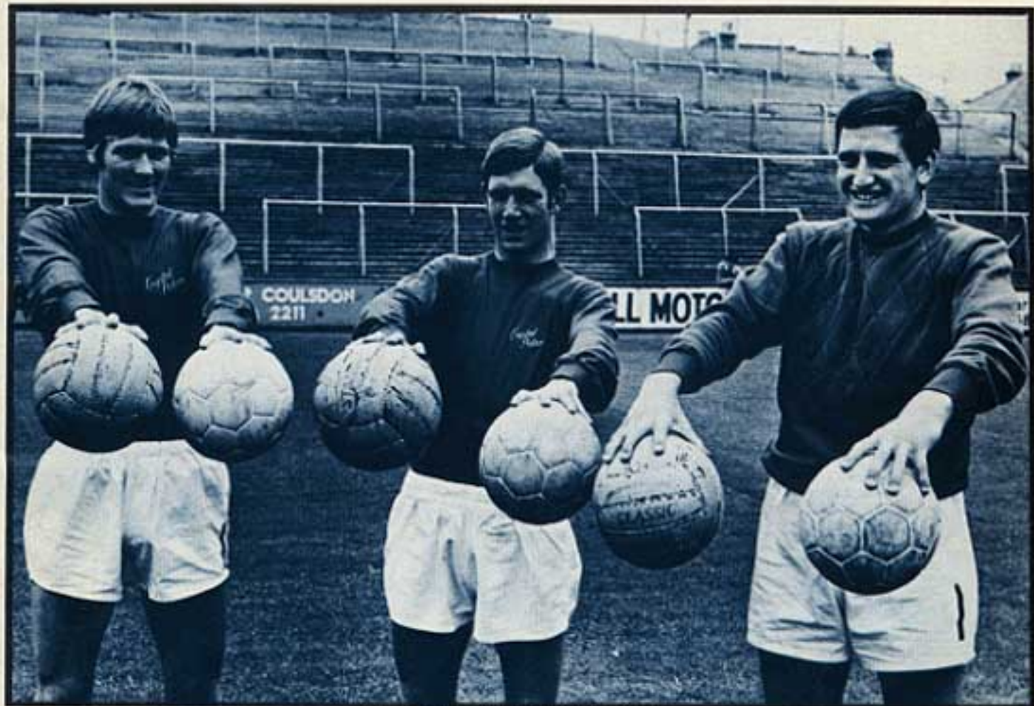
SPOT THE BALL FOR BEGINNERS