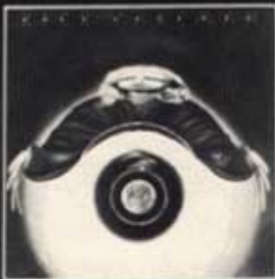
No Earthly Connection AMLK CKM YKCM 64583