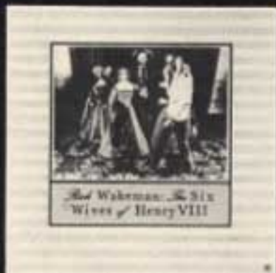
The Six Wives of Henry VIII AMLH CAM YAM YQM 64361