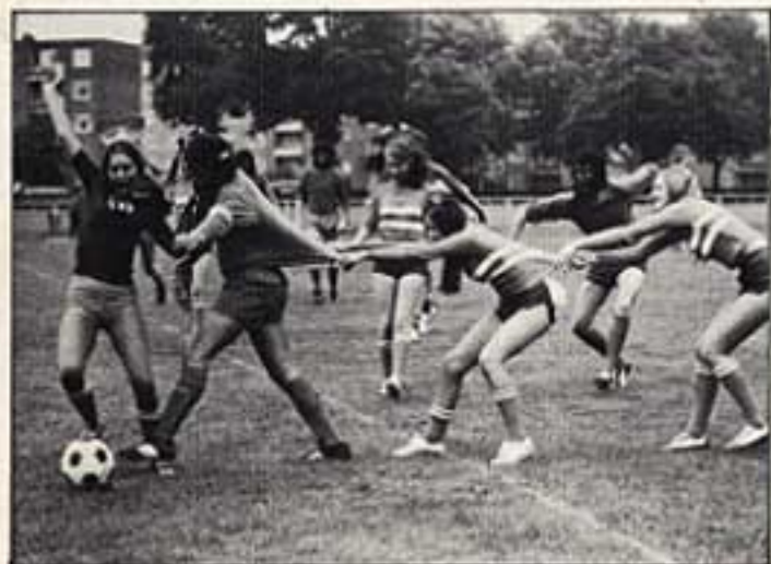
A FRIENDLY MATCH BETWEEN ROAD CREW ROVERS AND BUNNY ATHLETIC