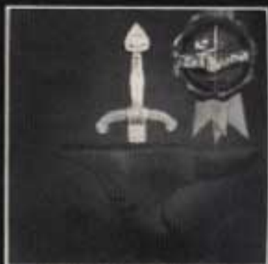
The Myths & Legends of King Arthur & the Knights of the Round Table AMLH CAM YAM YQM 64515