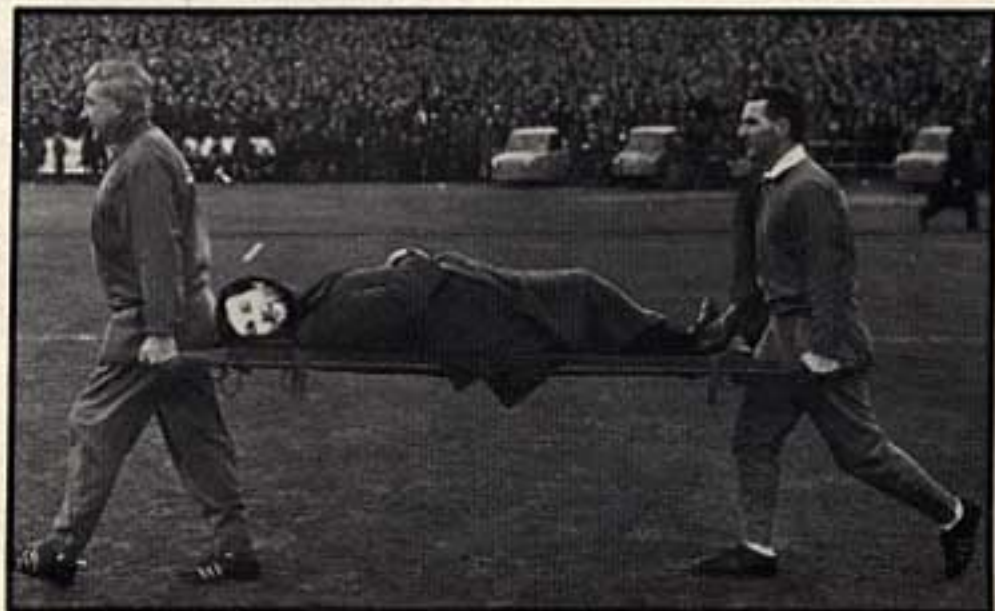
HARVEY GOLDSMITH AFTER CANCELLING A RECENT CONCERT