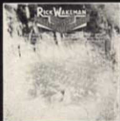
Journey to the Centre of the Earth AMLH CAM YAM YQM 63621