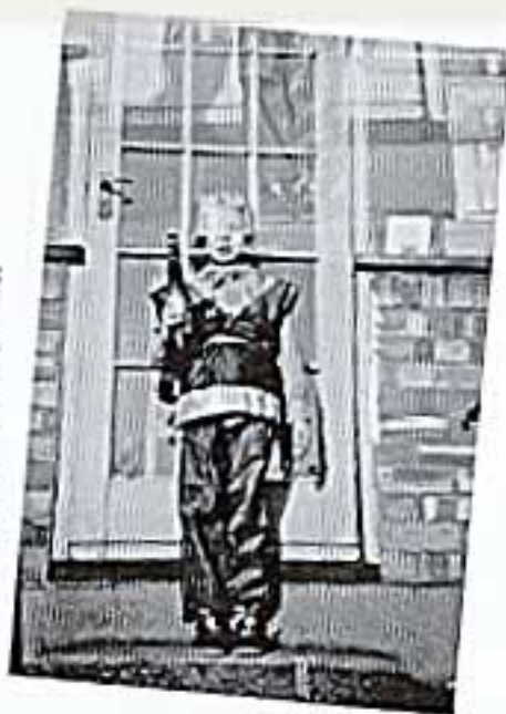
Rick spaced out and only nine.