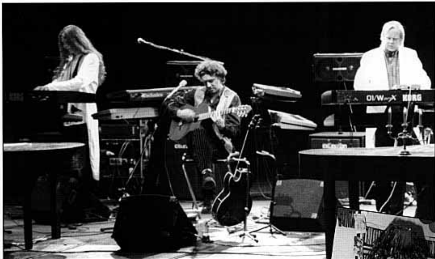
Above: A rare photograph of the three of them playing together - in time!!!